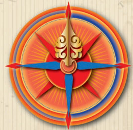
Chart your own course.

You can't control the wind but you can adjust your sails.